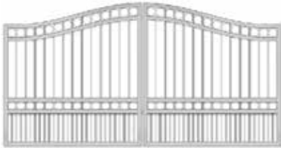
Curved Top with doggy bars