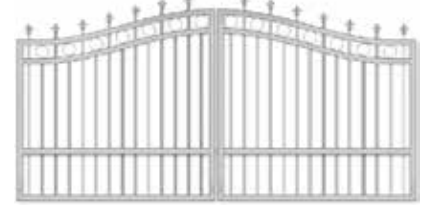
Curved Top with decorative scrolls & Spears