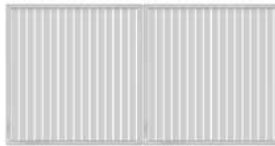
Vertical Slats 38mm, 65mm, 90mm