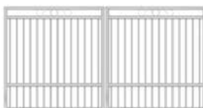
Flat Top with decorative scrolls